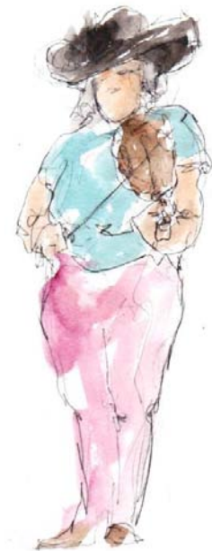
If you played at the SCVFA February jam, there is probably a sketch of you by Jim Smyth!